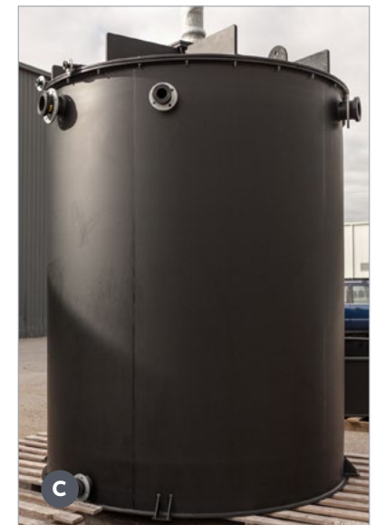
C Large HDPE mixing vessel complete with mounted / supported agitator.