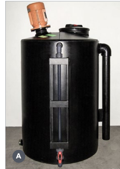
A Custom fabricated HDPE tank with roof mounted agitator designed to clients specifications and complete with internal conical base.